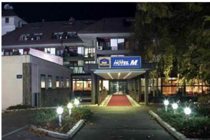
Best Western Hotel M