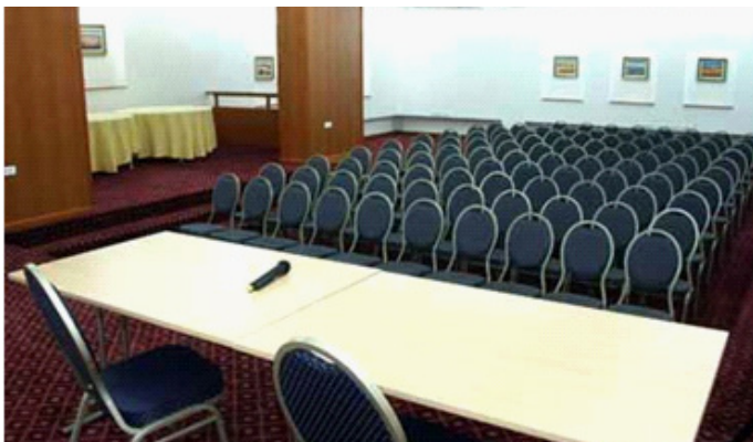
Best Western Hotel (Conference room)