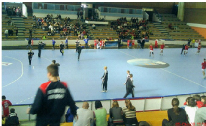
SC Voždovac - BANJICA